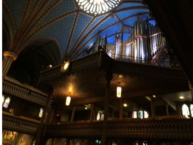
The Organ, Notre-Dame Basilica, Montreal, Canada, 2018.