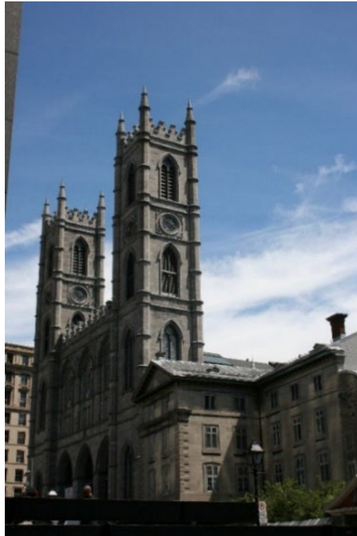
Notre-Dame Basilica, Montreal, Canada, 2016. The Basilica suggests the Gothic style.

Built in 1672 as the church of Notre-Dame, and later reconstructed by James O'Donnell, an Irish-American Anglican who converted to Catholicism, the Notre-Dame Basilica is a Gothic Revival (commonly referred to as Victorian Gothic or neo-Gothic) style of architecture, an architectural movement that began in the late 1740s in England (Discover Notre-Dame Basilica: History). “The Gothic grew out of the Romanesque architectural style when both prosperity and relative peace allowed for several centuries of cultural development and great building schemes” (V. Spanswick). The word Gothic is derived from the Goths, an alleged barbaric group who reigned in various regions throughout Europe between the collapse of the Roman Empire and the inception of the Holy Roman Empire from the 5th to the 8th century (V. Spanswick). As a result of their power during that period, the term Gothic began to apply to a type of architectural style (V. Spanswick).