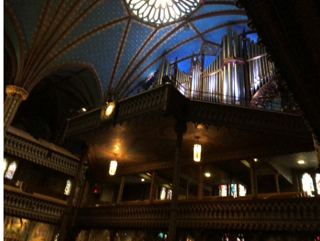
The Organ, Notre-Dame Basilica, Montreal, Canada, 2018.